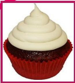
**NEW** 102 Red Velvet Cupcakes (V102XCUPREDV) $15.68 per 6pk