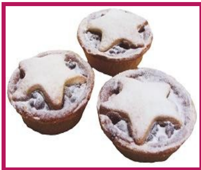
102 Uncle Tom's Fruit Mince Tarts (pictured)

Rich butter shortbread with our new improve fruit mince filling baked into an open tart. Sold in packs of 6 units