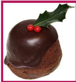
**NEW** 102 Individual Raspberry Choc Meltdown (V102XINRAS) $19.37 per 6pk