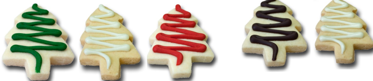
106 Choc Decorated Tree Mixed 18g x 20pk (2 Right trees pictured) V106XSBTC20 $16.89