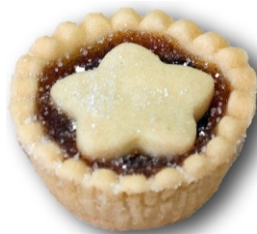
15g x 20pk Mini (photo on Left) V106XMMTS20 $18.27

106 Fruit Mince Tarts ** AWARD WINNING 2010** Baking Industry Association of Victoria Australia's Best Fruit Mince Tart