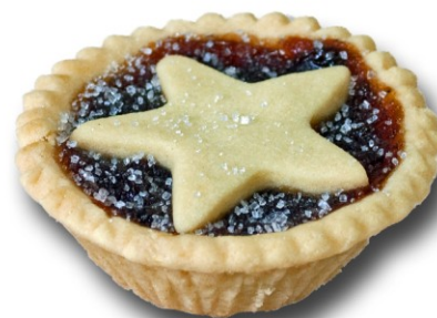
45g x 18pk Medium (photo on Right) V106XMMTS18 $22.19

106 Fruit Mince Tarts ** AWARD WINNING 2010** Baking Industry Association of Victoria Australia's Best Fruit Mince Tart