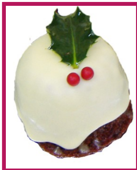
102 Drunken Individual Sticky Meltdown (pictured)

Drunken Sticky pudding with a brandy butter center presented with a brandy butter sauce fresh holly and sugar berries