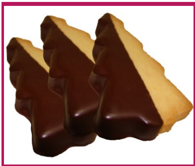
102 Christmas Shortbread (pictured)