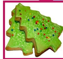
**NEW** 102 Christmas Tree Cookies (V102XMCOTR) $16.01 per 12pk