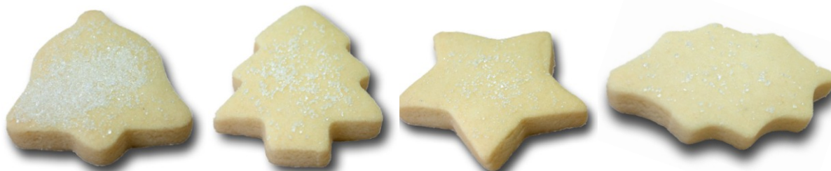
106 Xmas Shortbread Mixed 16g x 24pk V106XSBMP24 $10.44